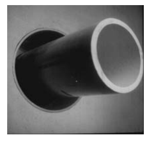
1. Center the pipe, cable or conduit in wall opening or casing. Make sure the pipe will be adequately supported on both ends. Link-Seal<sup>®</sup> modular seals are <u>not</u> intended to support the weight of the pipe.