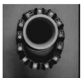
3. Check to be sure all bolt heads are facing the installer. Extra slack or sag is normal. Do <u>not</u> remove links if extra slack exists. Note: On smaller diameter pipe, links may need to be stretched.