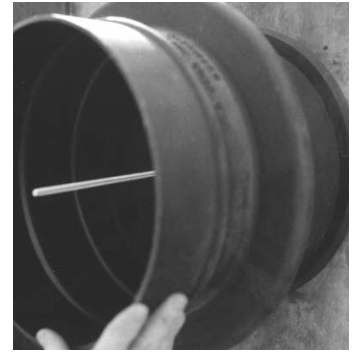
Place the sleeve over the end cap nailed to the form.

After nailing end cap to form, drive (threaded rod*) through the end plate and form and (thread nut*) on other side. Note : Remember to measure the (threaded rod*) to match the length of the sleeve.