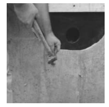
9. Chip excess concrete from the edge of the Cell-Cast<sup>®</sup> disk assembly and wall.