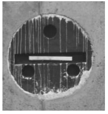
8. After wall cures, wall forms are removed. The Cell-Cast<sup>®</sup> disk assembly is now ready for removal.