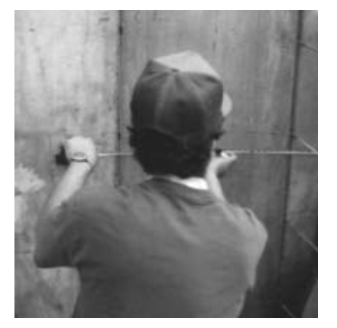
1. Locate center line where the hole is desired. This location will be used as a guide for the threaded centering assist rod.