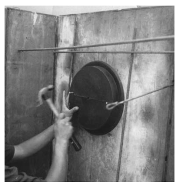
2. Nail one of the end caps at the marked center line. A 2" minimum clearance is suggested when nesting sleeves.