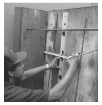
1. Measure the center line to position Century-Line<sup>®</sup> Sleeve end cap.

Century-Line <sup>®</sup> Sleeves are thermoplastic wall or floor pipe penetration sleeves. One person working alone can usually install a Century-Line<sup>®</sup> Sleeve regardless of the size.