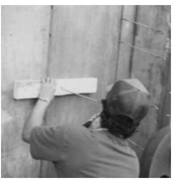
2. A 2x4 wood nailer is included. Fasten it along with the threaded rod directly to the concrete form. This provides support and helps center the complete Cell-Cast<sup>®</sup> disk assembly.