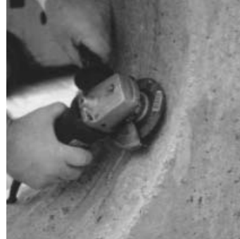
11. Inspect the installation. A smooth opening is important for a proper Link-Seal<sup>®</sup> modular seal installation. Repair voids and grind smooth any ridges.