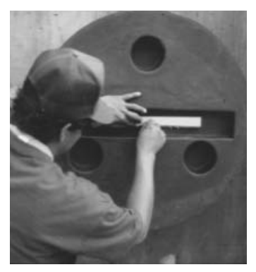
6. Guide the 1" wood block over the threaded rod and secure the assembly with the wing nut provided.