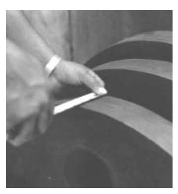
5. Additional disks are interlocked to accommodate finished wall thickness. Verify thickness is the same as wall.