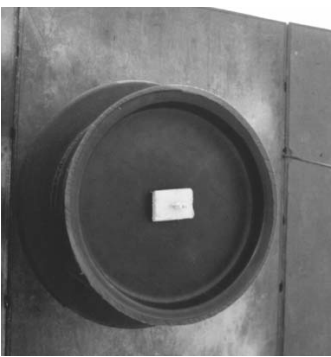
Place second cap on the sleeve and use a (block of wood*) and (wing nut*) to tighten unit in place. Make certain sleeve is plumb.